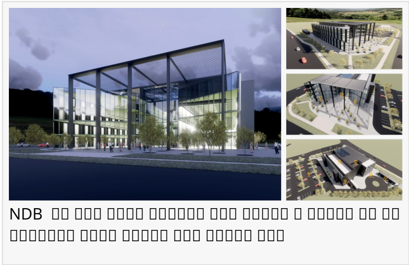
NDB is pleased to announce the construction of a new building. The building is a modern, multi-story structure with a glass facade and a large, open-plan interior. The building is located in a prime location and is expected to be completed in the near future. The building will provide a new home for the bank's operations and will be a significant addition to the community.

North Dakota Bank, February 28, 2023 /EINPresswire.com/ -- North Dakota Bank (NDB) Inc. is pleased to announce the construction of a new building. The building is a modern, multi-story structure with a glass facade and a large, open-plan interior. The building is located in a prime location and is expected to be completed in the near future. The building will provide a new home for the bank's operations and will be a significant addition to the community.