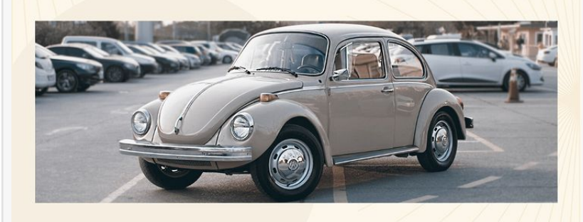
Classic Car VIN Decoder

CLASSIC DECODER CHECKS VEHICLES THAT ARE OLDER THAN 1981. THEY ARE ALSO TERMED "ANTIQUE" OR "PRE-1980" VEHICLES. IT WILL ALLOW CLASSIC CAR OWNERS, BUSINESSES, AND DEALERS TO DECIPHER OLD CARS' VIN EASILY.