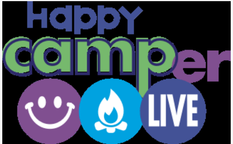
Happy Camper Live Logo

purchase mirroring some activities throughout the day with the proceeds benefitting the Happy Camper Project – a non profit supporting summer camps and expenditures not covered by traditional funding.