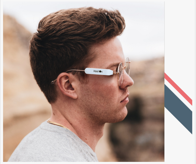
HoldOn EyeCare Clip Aqua. The World's First Device To Combat Poor Posture Through AI Technology & Vibration