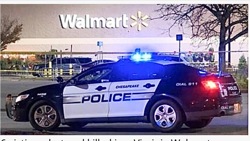
6 victims shot and killed in a Virginia Walmart