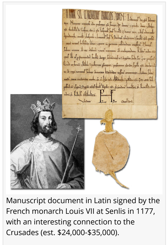
Manuscript document in Latin signed by the French monarch Louis VII at Senlis in 1177, with an interesting connection to the Crusades (est. $24,000-$35,000).

Lot 105 is an autograph album signed by three current and future U.S. presidents – Lincoln, Grant, and Garfield – plus approximately 140 additional signatures of mostly Civil War-era military personnel, politicians, and other notables. The album, with 1896 newspaper article provenance giving an eyewitness account of Lincoln's signing his autograph in Washington, D.C. in 1862, was compiled by a Civil War veteran from Peoria, Illinois (est. $16,000-$20,000).