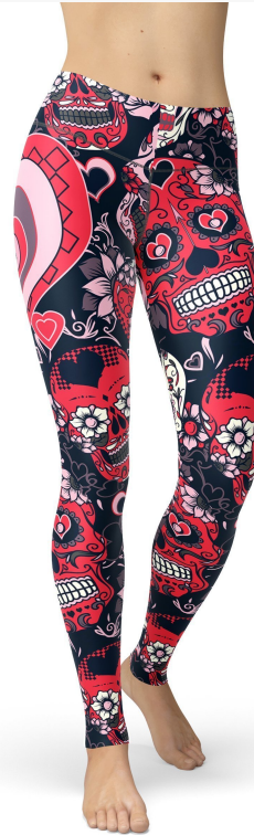
Valentine Sugar Skulls Leggings to Wear at The Burning Man Festival from Happybeingwell.com

Happybeingwell.com is North America's self-care online store. Happybeingwell.com, a fully integrated self-care online store, introduces both: high-quality and affordable self-care products and free inspiring educational self-care content. Through Happybeingwell.com, customers can download free self-care resources such as self-care journal prompts, plant-based recipes and a meditation E-Book while purchasing upscale stylish activewear leggings with a focus on quality, comfort & style. We also provide the best in natural essential oils, natural soaps, natural candles, natural facial masks, natural deodorants, crystals and much more wellness products. Be sure to follow @Happybeingwell on Instagram, become a brand ambassador and for