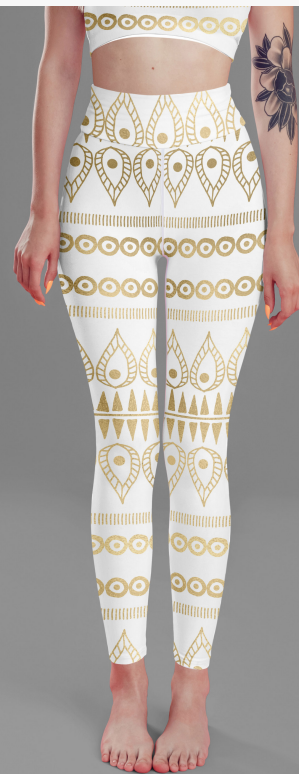
Bohemian Gold White High Waist Yoga Leggings to Wear at The Burning Man Festival from Happybeingwell.com