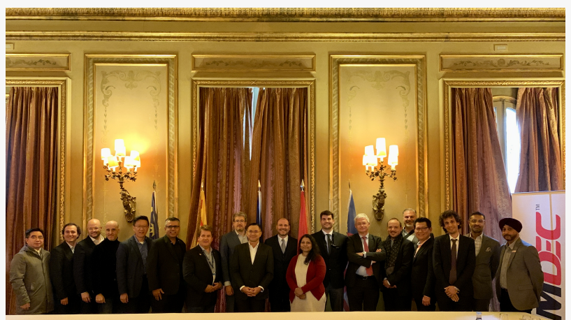
Spanish companies with Malaysian Digital Economy Corporation

BARCELONA, SPAIN, February 28, 2023 /EINPresswire.com/ -- In parallel to the Mobile World Congress, the Malaysian delegation of the Ministry of Communications and Digital (MDeC), the agency under the Malaysian Ministry of Communications and Digital (KKD), leading the digital transformation of the economy has organized sides events in Barcelona to promote cooperation between Spanish digital companies and Malaysia.