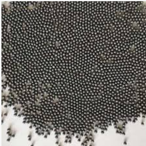
NuSoft Blast Media