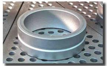
Extrusion Die Cleaning