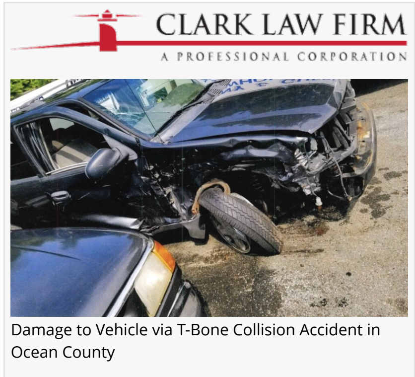
Damage to Vehicle via T-Bone Collision Accident in Ocean County

BELMAR, NEW JERSEY, UNITED STATES , March 7, 2023 /EINPresswire.com/ -- On July 27, 2018, our client was on her way to buy her 8-year-old grandson a birthday present when an 18-year-old defendant drove through a stop sign and collided with our client's vehicle. The defendant stated, "I thought I could make it." Unfortunately, this was not the case and the crash caused the client's car to catch fire and she was removed from the vehicle and placed down on a nearby lawn while EMS personnel arrived at the scene.