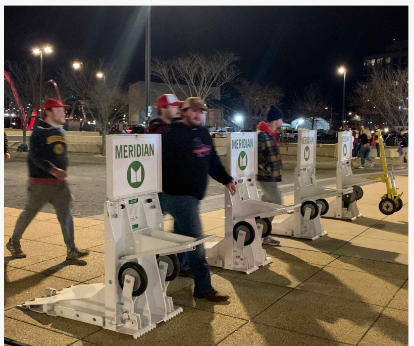
Archer 1200s Audi Field