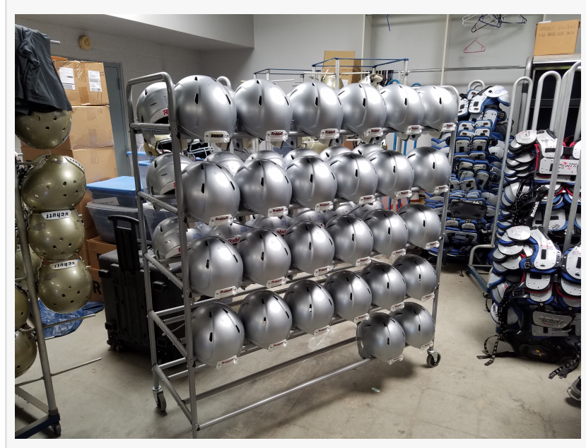
Treated football helmets with Helmet Glide by Diamond Seal Systems which improves the deflection ratio and decreases surface tension for safer helmet to helmet contact

company has been sold. DSS has no obligation to manufacture its line for the new owners and is possibly looking to take on the marketing efforts internally. DSS is open to outside marketing companies to pick up its Car line and is currently considering one possible source. This is very early in a possible move for outside sourcing, but DSS shows that all options are on the table. Diamond Seal Systems is hoping to move on this segment mid 2nd quarter. The Car line consists of Nanotechnology car detailing products such as 7H Ceramic DIY car paint coating/sealant, Graphene sealant, Trim restoration spray-on that restores shine and luster to sun damaged rubber, plastic and other synthetic trims, a water-less car wash, a scratch swirl reducer/remover and a hydrophobic windshield treatment, to name a few products. The revenues in this segment in 2022 were over 1.2 million and that represents approximately over 4 million in the retail market. "We are hopping to find a marketing company to run with this segment for the simple