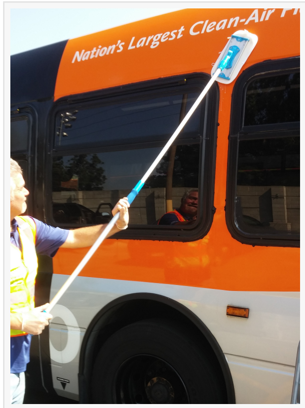
So. Cal. Bus - Cleaned and Restored Water Spot Damage on Windows and then Treated with Diamond Seal Systems Protective products on windows, paint, stainless steel and plastic-rubber trims.

DSS has a unique formula for success; Keeping costs down and quality high with fast turnarounds times. Spencer Aiken, VP Operations says, "With the new inline bottle filling system, we are able to fill over 100,000 bottles in a month. This has led to a manageable growth for Diamond Seal." DSS products