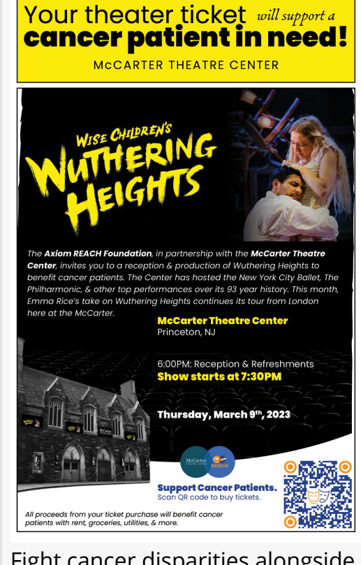
Fight cancer disparities alongside your community!

Tickets and sponsorship are <u>available now</u> to the groundbreaking production of Wuthering Heights set to benefit cancer patients.