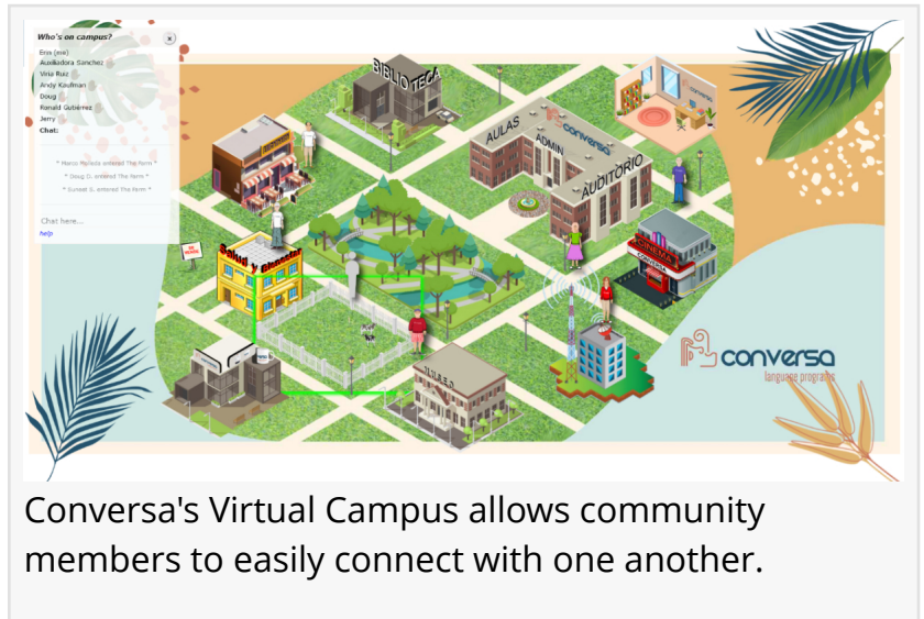
Conversa's Virtual Campus allows community members to easily connect with one another.

SANTA ANA, SAN JOSE, COSTA RICA, March 3, 2023 /EINPresswire.com/ -- Conversa, a pioneering online Spanish school , today announced the launch of a new virtual campus feature, allowing students to engage in live Spanish conversation with other community members by clicking on their avatar. In addition to the live Spanish instruction that Conversa offers as its primary service, the virtual campus brings students and teachers together for live Spanish workshops and spontaneous conversations, allowing for richer interaction.