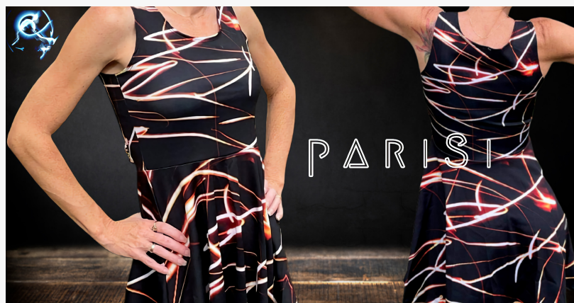
Handcrafted Red and Black Skater Dress by P A R I S I