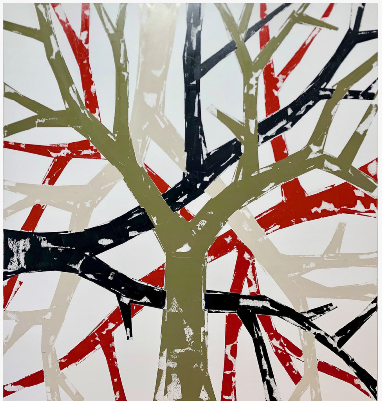
Snowman 3, 2022, Oil, Acrylic on Canvas by George Lawson 70 x 66 in.