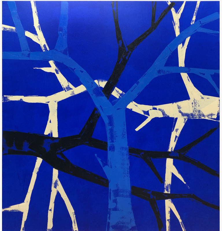
Snowman 1, 2022 Oil, Acrylic on Canvas By George Lawson, 70 x 66 in

While viewers may likely see pictures of trees with crisscrossing "limbs" at different times of year in various lighting conditions -- these paintings are just as much about examining how paint can be manipulated, as well as the exploration of color combinations that lay between harmony and dissonance. The imagery also speaks to the