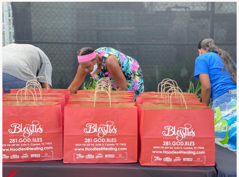
Hoodies4Healing.com Serving the Community

This press release can be viewed online at: https://www.einpresswire.com/article/619922618