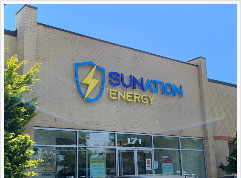
SUNation Energy continues to be recognized by Long Islanders year after year.

Long Islanders from the East End also voted in 2022 for the Dan's Papers Best of the Best competition. Thousands of residents voted from October through the end of December for businesses along the North Fork and South Fork. SUNation Energy won both categories it was