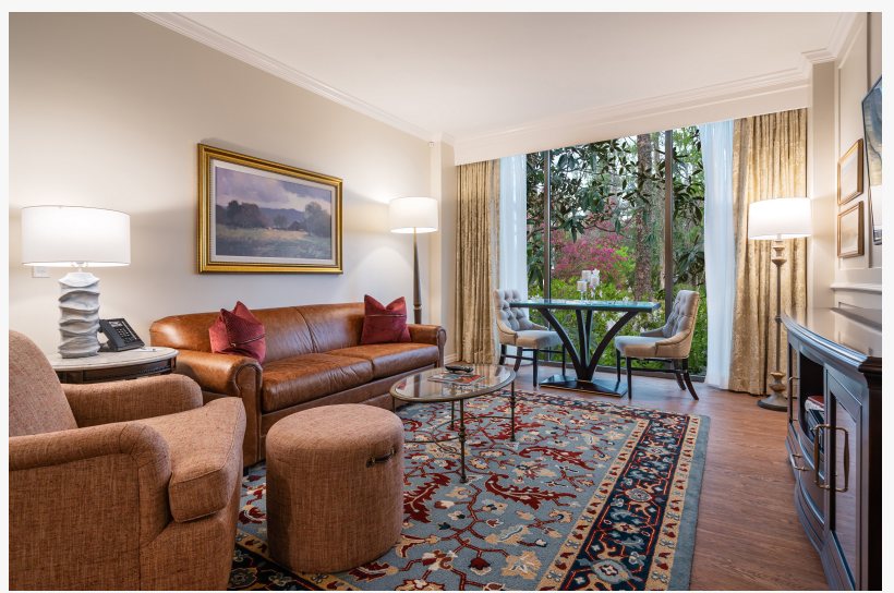
The Houstonian Hotel's newly renovated rooms suites feature floor-to-ceiling views, color-spun decor, and tables for two by the window.

300 pieces of equipment, indoor turfed fitness zone, enhanced group exercise fitness studios, cycle studio, a private yoga studio with aerial silks, and an indoor basketball court. The club also provides 2 areas for children ages 6 weeks to 12 years, kids camps, and special events and programming – all available to registered hotel guests for applicable fees, plus an outdoor playground and butterfly garden. The club's new full-service restaurant and bar with indoor/outdoor adult and family-friendly dining is called The Kitchen, poolside dining is available at the expansive Arbor Grill, with wood decks, TVs, and a fire pit, and the club's new grab-and-go is called Refuel offering light fare and Starbucks Coffee. The club offers a full-time nutritionist, and a wellness therapy suite called The Covery.