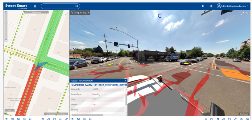
Cyclomedia's Road Surface Analysis Product