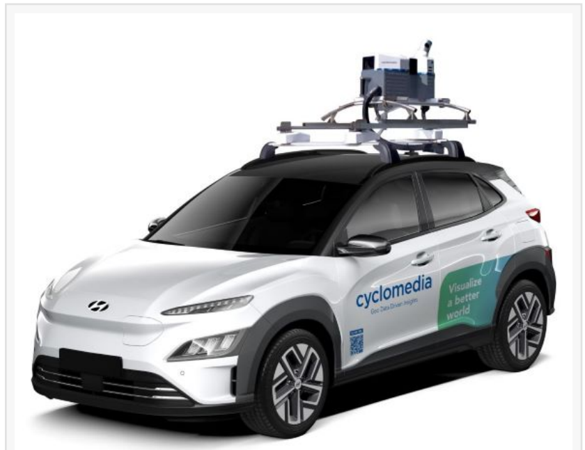
Cyclomedia's specially-equipped vehicles