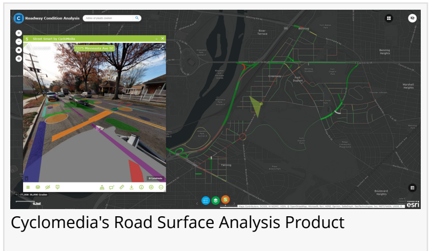
Cyclomedia's Road Surface Analysis Product

This press release can be viewed online at: https://www.einpresswire.com/article/619947200