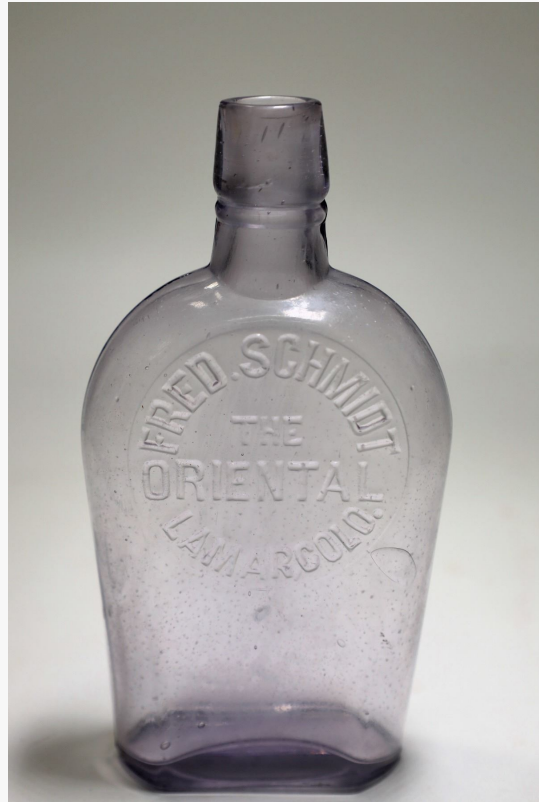
Circa 1894-96 Oriental coffin flask out of Lamar, Colorado, lavender in color, 6 inches tall, with an unmarked base, a top with a collar and a hazy interior ($1,500).

A five-piece Tiffany "Zodiac" desk set, including a rare match safe, climbed to $1,000. In the early 1900s Louis C. Tiffany designed 24 different patterned desk sets. The pieces were sold individually, to meet customer demand. Some patterns are rarer than others, making them highly desirable. Nearly 1,000 different set pieces were made from 1900-1933 in all patterns combined.