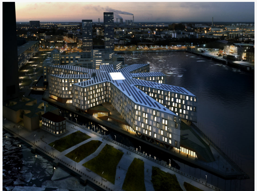
UN CITY by 3XN Architects

UN City, designed by Danish architecture firm 3XN, was inaugurated on the 4th of July 2013 by Secretary-General Ban Ki-moon and Her Majesty Margrethe II of Denmark. UN City consists of 11 United Nations agencies, and it currently accommodates 2,000 employees from 104 different countries.