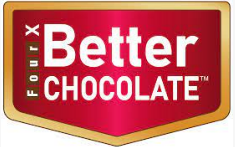
FourX The Better Chocolate

To speak with Suzie about the launch of the world’s first functional chocolates with benefits or to request a sampling kit, please contact: Colleen McCourt, PR & Media Relations e: Colleen@FrontDoorPR.com c: 705-358-2006