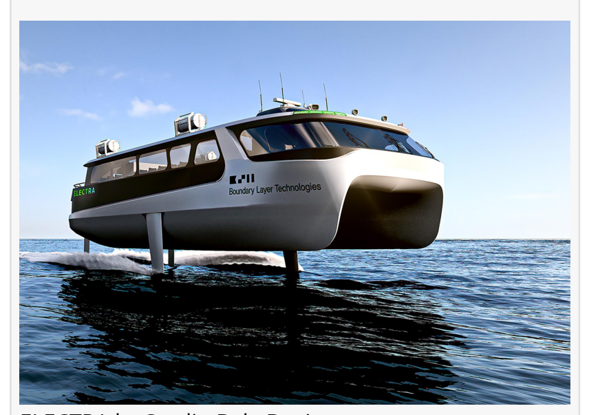
ELECTRA by Studio Bela Design

This press release can be viewed online at: https://www.einpresswire.com/article/620349896