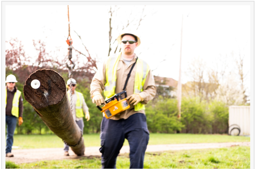
Restoration work like this crew resetting a pole will be expedited with Mobile Workbench for Construction.

According to Villali, utility construction and restoration work takes longer and costs more, in part, because workers lack real-time data on assets and work. Crews spend a lot of time waiting for materials and on administrative tasks like time-tracking. They also struggle with cumbersome processes for documenting, for example, as-built reports and plans and quickly updating systems of record with that information. With mobile workforce management solutions in place, IDC research showed fieldworker productivity climbed 15 to 25 percent