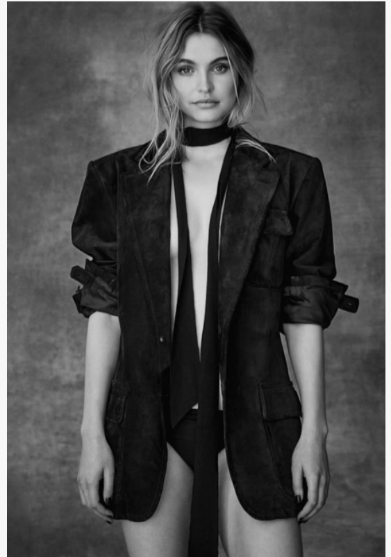
Breast Augmentation Manchester Beauty

This press release can be viewed online at: https://www.einpresswire.com/article/620413572