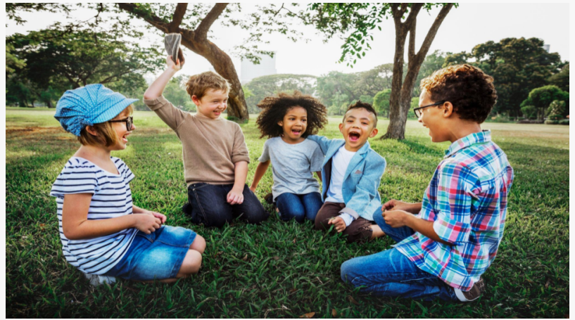
Kids being empowered by the program

In the collaboration between Xcellent Life & Sky High for Kids, the Xcellent Life Sky High Wellness