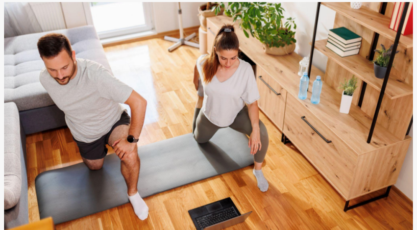
Working out with a loved one