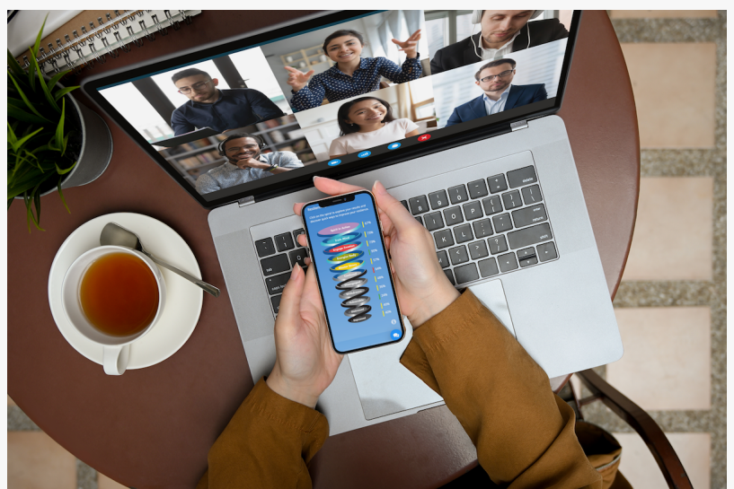
The Resilience Digital Toolkit

LAUSANNE, VAUD, SWITZERLAND, March 6, 2023 /EINPresswire.com/ -- Drawing on two decades of research and development, the Resilience Institute announces the fifth generation of its Resilience Diagnostic and Development Model.