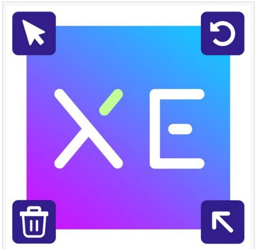
Riaxe Product Customizer for Shopify stores

It allows Shopify stores to sell customized products designed by customers using the Shopify product designer tool, manage print production workflows, and automate entire sales process with AI driven customer communication all in one place. This means that Shopify stores can save time, streamline store management and sales without having to switch between multiple tools. Riaxe believe that this app will be a game-changer for all custom printing businesses on the Shopify platform and can't wait to see the success it brings to the users. It enables: