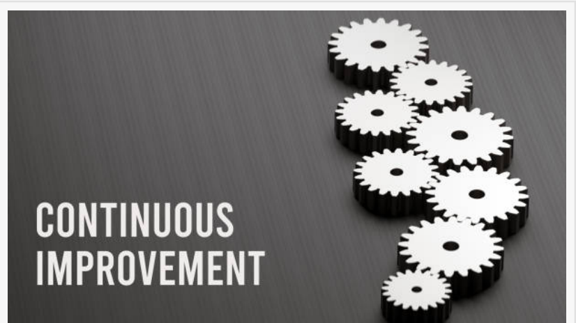
Using Data to Continuously Improve

Building strong partnerships is essential for student success. When families are involved in their child's education, students are more likely to attend school regularly, complete homework, and succeed academically. As the principal, we are responsible for creating opportunities for families to get involved in the school community and to communicate regularly with them about their child's progress.