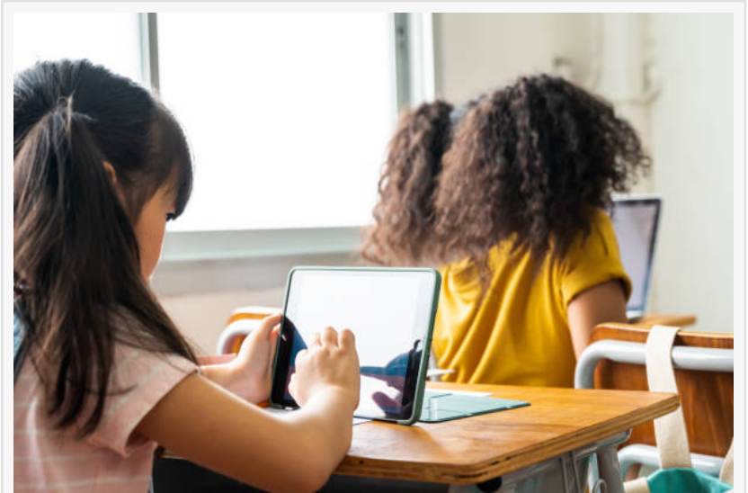
Set High Expectations & Increasing the Use of Technology In Schools

learned valuable lessons about improving a school academically, and I want to share them because these keys to success will universally work regardless of the educational environment.