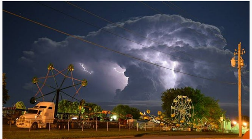
Severe weather strikes festival

Event producers around the world have safety plans in place and do what they can to notify attendees and get everyone to safety, but some of these plans are archaic to say the least. Plans ranging from having someone watching the sky and listening to local radio for updates to others having teams tracking multiple weather reports and more, but Throwdown at the Campground is leading the charge when it comes to the safety of their guests whom they've named their Throwdown Family.