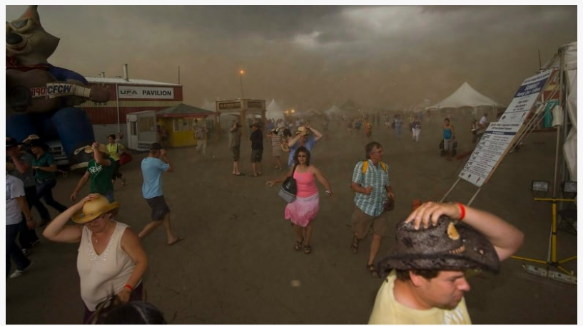
Attendees evacuating event as weather strikes

partnered with the creators of the most powerful weather tracking app available, RadarOmega . Instead of tracking multiple sources for updates in severe situations to decide on a safety call, they can follow precise high resolution single site radar data that keeps them aware of rapidly changing weather conditions that is faster than most conventional weather applications on the market.