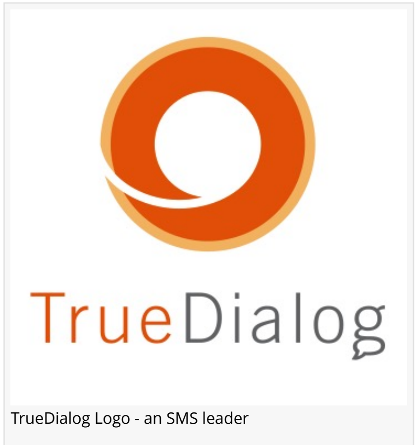
TrueDialog Logo - an SMS leader