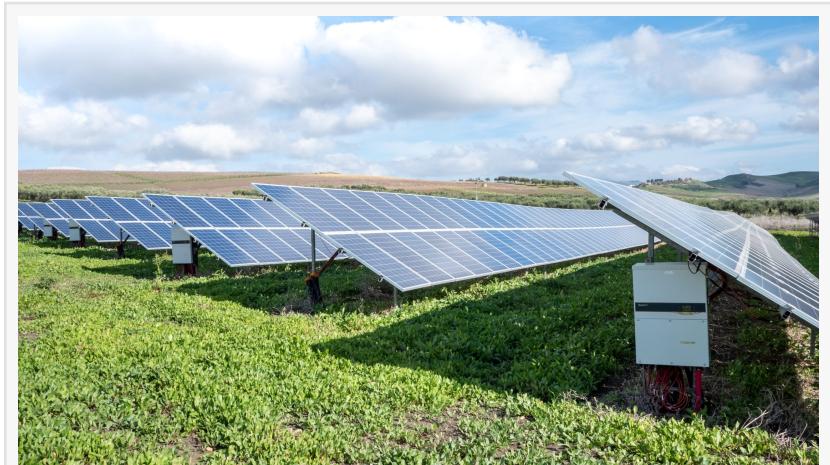
CCEF can finance a wide range of clean energy projects, including solar racks for businesses like the one pictured here.

DENVER, COLORADO, UNITED STATES, March 7, 2023 /EINPresswire.com/ -- Colorado Clean Energy Fund (CCEF), a non-profit investment fund that fills financing gaps in clean energy projects across Colorado, recently released its 2022 annual impact report following the organization's first full operating year. The report details CCEF's reach throughout 46 counties in Colorado in both the residential and commercial sectors.