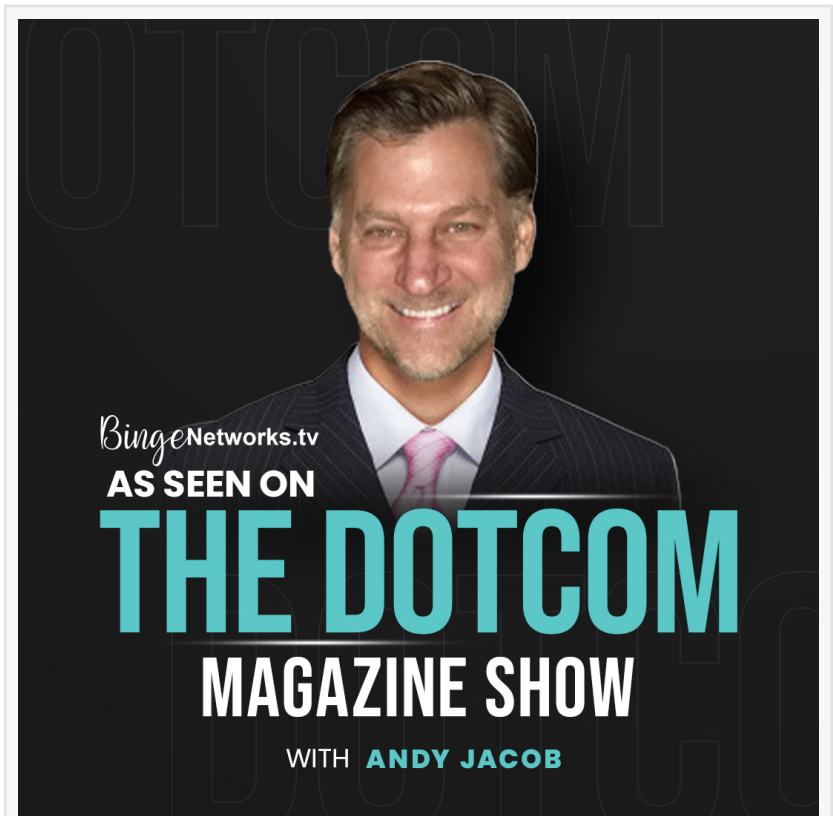
The DotCom Magazine Entrepreneur Spotlight Series-Featured Interview