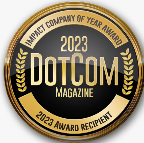
The DotCom Magazine Entrepreneur Spotlight Series- Impact Company

EIN Presswire's priority is source transparency. We do not allow opaque clients, and our editors try to be careful about weeding out false and misleading content. As a user, if you see something