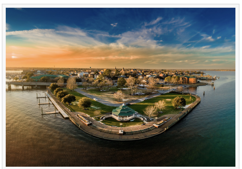
Historic New Bern, North Carolina – On the banks of the Trent & Neuse Rivers

Painting venues include historic New Bern, the first state capital and secondoldest European-American town in North Carolina; Beaufort, the home of the North Carolina Maritime Museum; and Oriental, the sailing capital of North Carolina. In addition, artists will choose more sites and landscapes in Craven, Carteret, and Pamlico Counties.