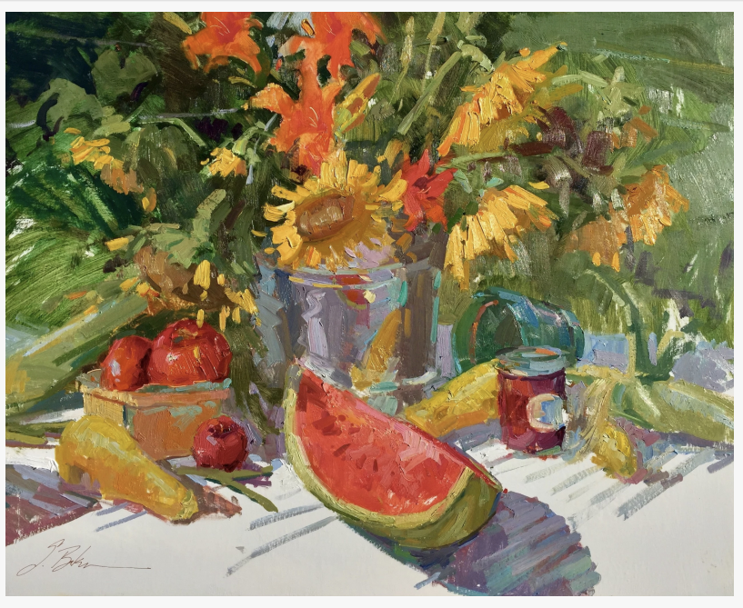
Art by Suzie Baker – North Carolina Plein Air Art Festival in New Bern

Festival headquarters, including demonstrations, workshops, art displays, and sales, will be based in historic New Bern's Farmers Market,