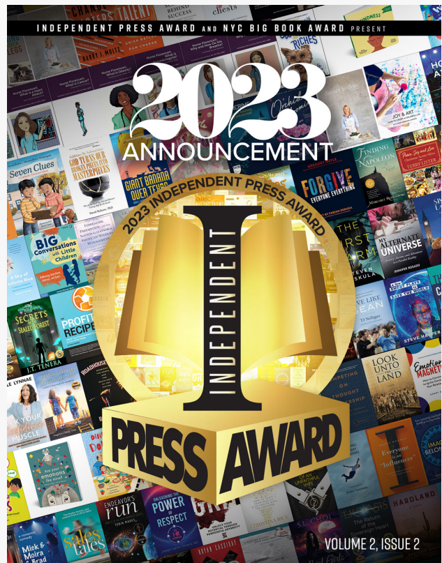
2023 IPA Announcements