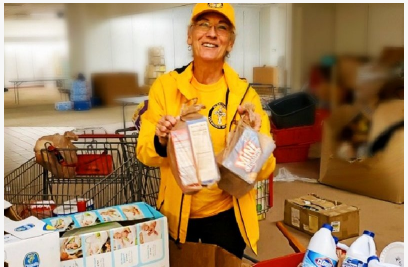
Volunteer Minister from the Church of Scientology Nashville helped provide supplies to those left stranded by the flood.