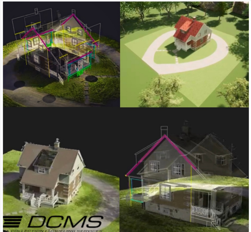
3d scan of a structure

DCMS As-Built services use 3D Scanning technology and features the new Leica RTC360 laser scanner. The RTC360 laser scanner provides clients with precise 3D visualizations crucial to As-Built Services by capturing over one million points per second, creating 360-degree scans in minutes, and providing exceptional accuracy.