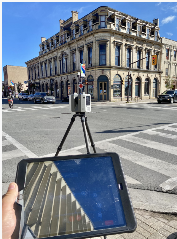
scanner and building