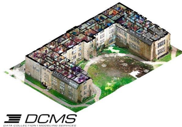
AS built of a building