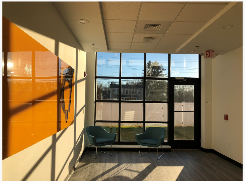
The We Level Up New Jersey Rehab Center is Accredited, Licensed & Top-rated