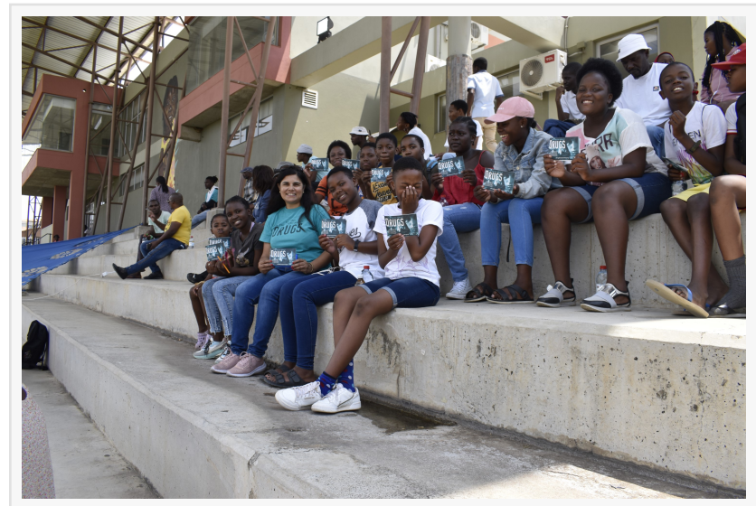
Kids reading Truth About Drugs booklets.

This press release can be viewed online at: https://www.einpresswire.com/article/620952900