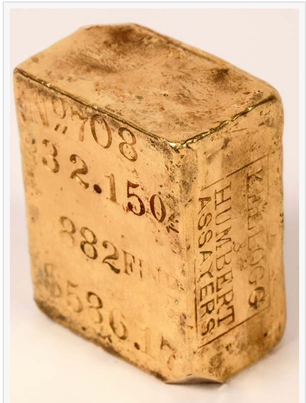
This 32.15-ounce Kellogg & Humbert assayer's California Gold Rush ingot recovered from the 1857 sinking of the S.S. Central America sold for $138,000 in the March 2023 auction by Holabird Western Americana Collections.