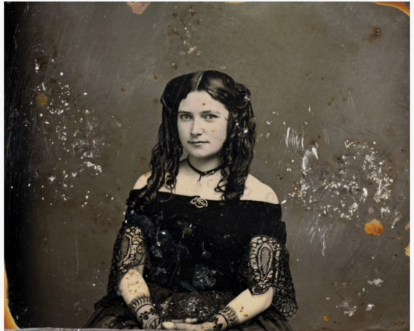
19th-century daguerreotype photograph of an unidentified young woman that the S.S. Central America scientific mission recovery team nicknamed, "Mona Lisa of the Deep" ($73,200).