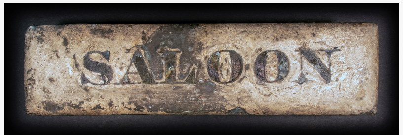
This saloon sign from the fabled “Ship of Gold,” the S.S. Central America that sank during a hurricane off the North Carolina coast in 1857, brought $13,200 in the March 2023 auction conducted by Holabird Western Americana Collections.