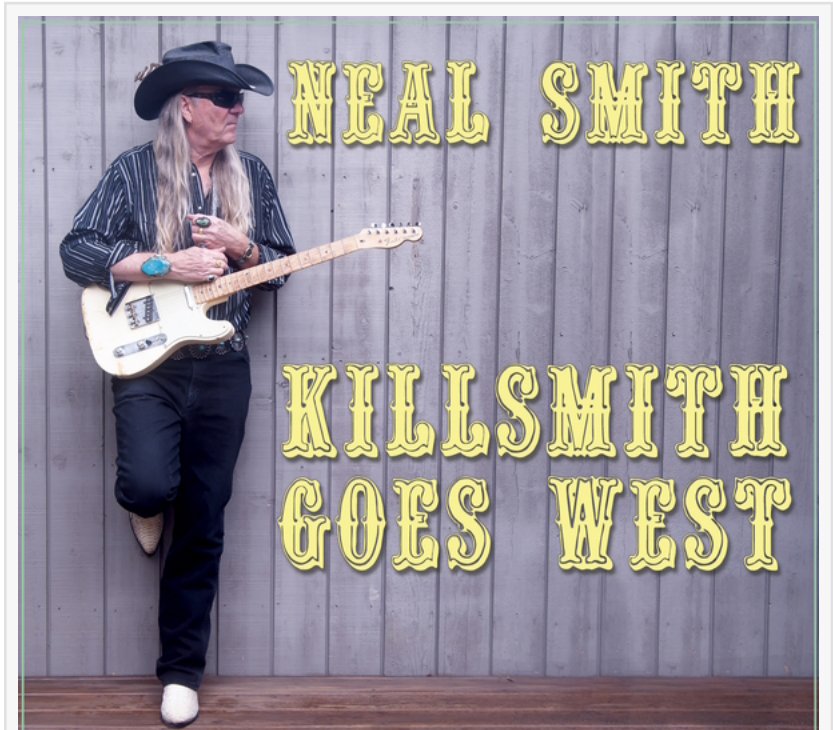
Neal Smith - KillSmith Goes West

ASHEVILLE, NC, USA, March 8, 2023 /EINPresswire.com/ -- Neal Smith's newest album, "KillSmith Goes West," the fourth in his KillSmith solo series, is heading in a whole new direction partner. Neal's percussive, musical and songwriting contributions and influence to the world of rock are undisputed. From the ground breaking shock rock direction of the multi gold, multi-platinum legendary band "Alice Cooper," until the present, Neal has always taken on the challenge of exploring new musical directions.