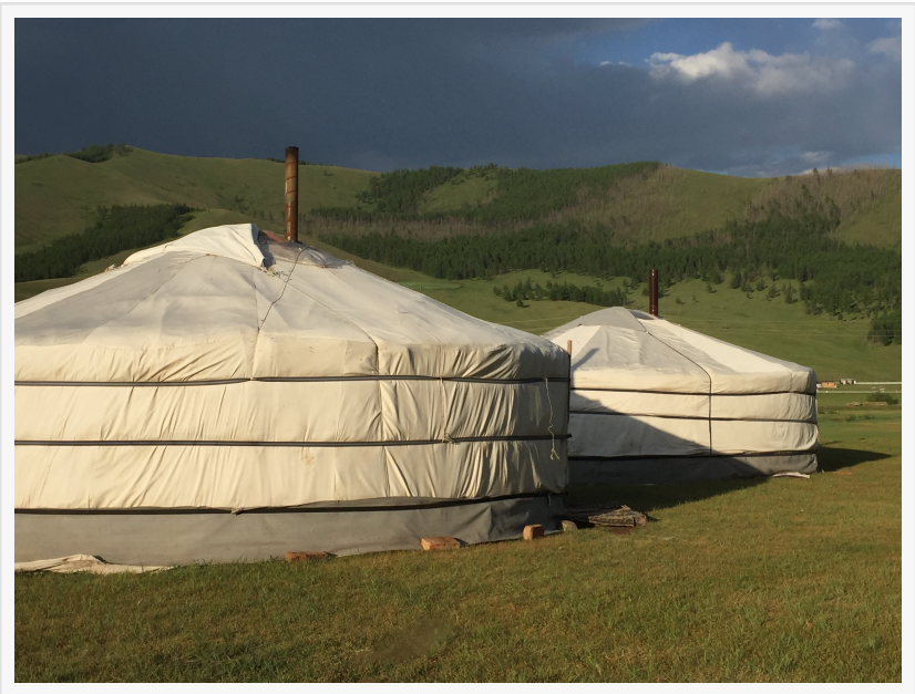
Stay in a traditional Mongolian ger (yurt) as you travel through the country.

ULAANBAATAR, ULANBAATAR, MONGOLIA, March 16, 2023 /EINPresswire.com/ -- Ever dream of taking part in an exotic adventure in a far-off land? Somewhere with a unique culture and stunning natural scenery? If so, put Mongolia squarely on the list. Mongolia was completely closed off during the COVID pandemic, the country successfully opened up to visitors again in April 2022 and is looking forward to welcoming new travelers this 2023 season. With its vast