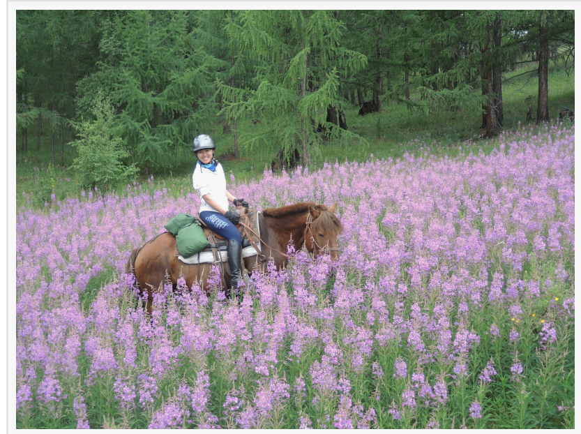
Riding among many wildflowers is one of the little know pleasures of a horse ride in the National Parks and mountains of Mongolia with Stone Horse Expeditions

As an expat living in the country and working with a number of different park projects over the years, Keith has traveled to many areas, gaining extensive experience and knowledge of the country, with what he does especially focused on horse-riding expeditions in the Khentii Mountains in the northern portion of Mongolia. Mongolian horses are tough and with great stamina, doing multi-day trips into the back-country covering terrain that climb over mountain passes used since ancient times, crossing rivers, where these strong horses are adept with this skill, and move across the landscape with a grace and beauty only a horse can provide. "What I do now is undertake these horse-riding trips