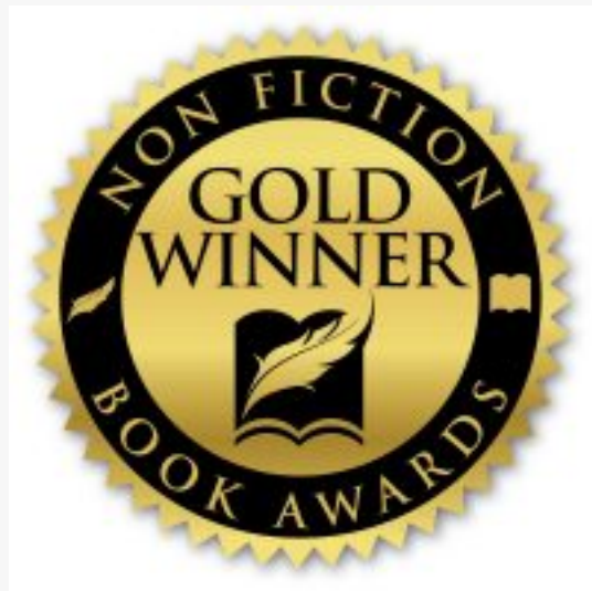
Gold Medal Award Nonfiction Authors Association