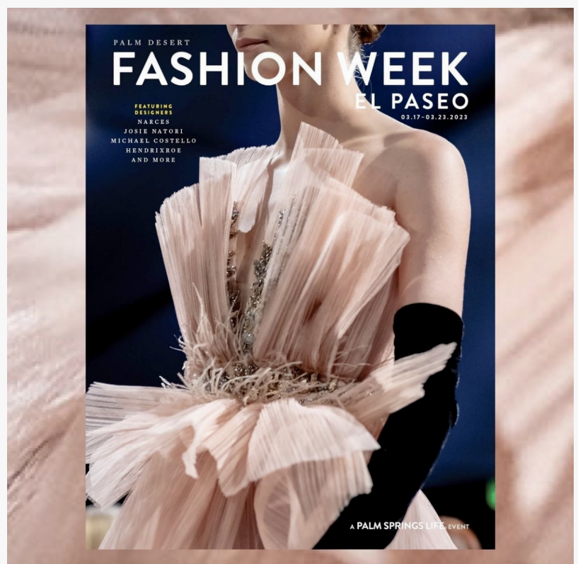
Palm Desert Fashion Week El Paseo. A Palm Springs Life Magazine Event