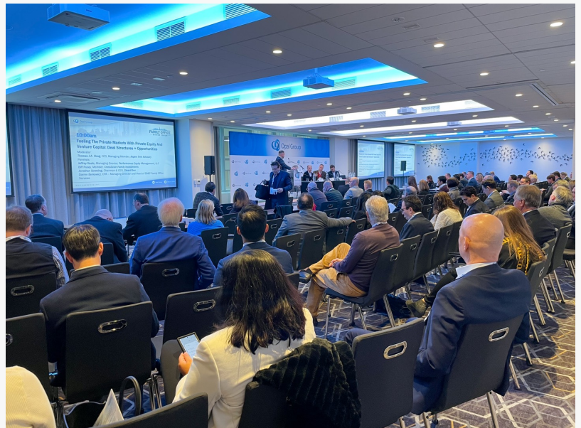
Family Office Winter Forum Presentation