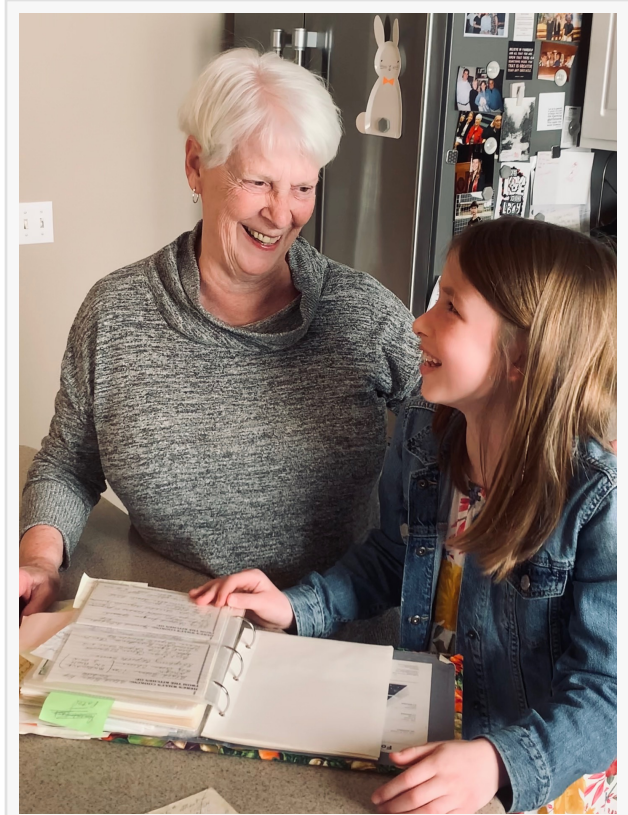
A grandmother and her granddaughter look through the family cookbook.