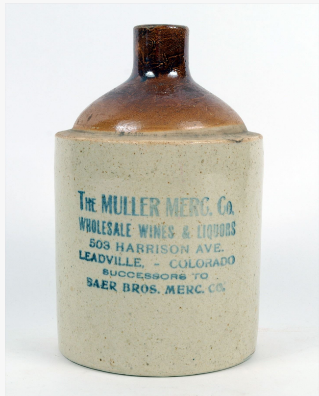
Two-tone jug for Muller Merc Co. ("Wholesale Wines & Liquors / 503 Harrison Ave. / Leadville, Colorado"), 9 inches tall (est. $500-$900).