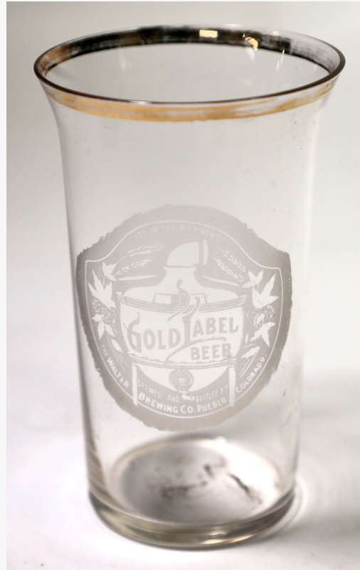
Gold Label Beer glass with partial gold on the rim, stenciled, “It’s in The Brewing” / Gold Label Beer / Brewed and Bottled By / The Walter Brewing Co. / Pueblo, CO” (est. $500-$1,000).

Day 2, on Sunday, March 19th, will be packed with more than 600 lots in categories that include art, sports, philatelic, mining, stocks and numismatics.