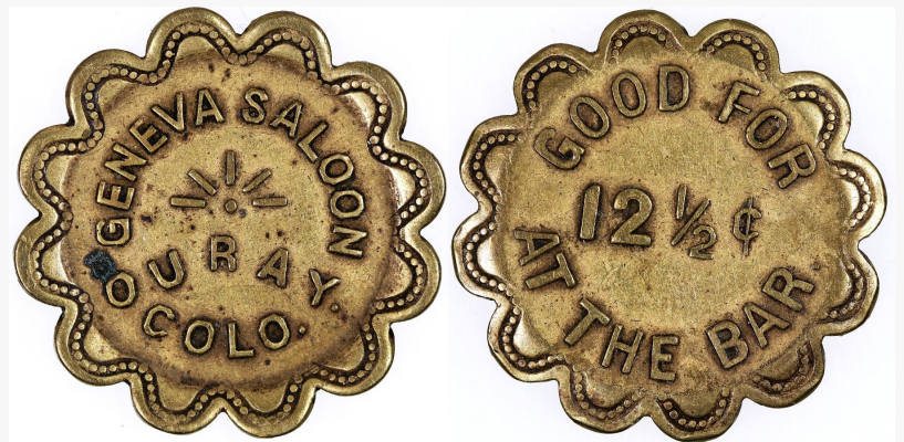
R-10 token from Oray County, Colorado for the Geneva Saloon ("Good For / 12 ½ Cents / At the Bar"), 26mm in diameter (est. $200-$800).