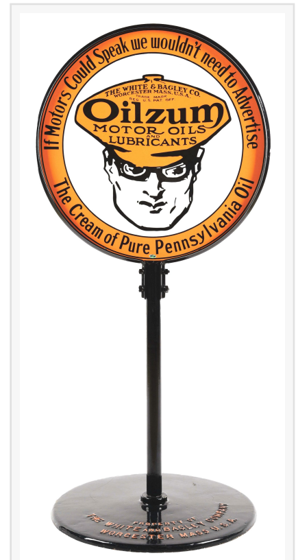
Rare and outstanding Oilzum Motor Oils & Lubricants porcelain curb sign, double-sided with ‘Oswald the Driver’ image, circa 1930s. Estimate $50,000-$100,000

A rare and outstanding circa-1930s Oilzum Motor Oils & Lubricants (Worcester, Mass.) porcelain curb sign is double sided and features the image of their capped and goggled mascot “Oswald the Driver.” It displays crisp, bright colors, retains its original base, and gets superlative marks for condition, graded 9.75 on Side 1 and 9.5+ on Side 2.