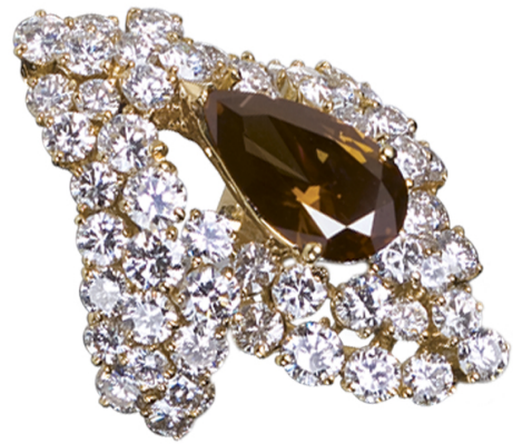
MOUSSAIEFF BROWN DIAMOND HIGH JEWELLERY DRESS RING

This press release can be viewed online at: https://www.einpresswire.com/article/621812304