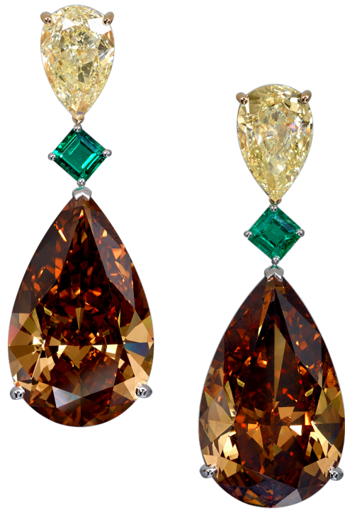
MOUSSAIEFF BROWN & YELLOW HIGH JEWELLERY EARRINGS