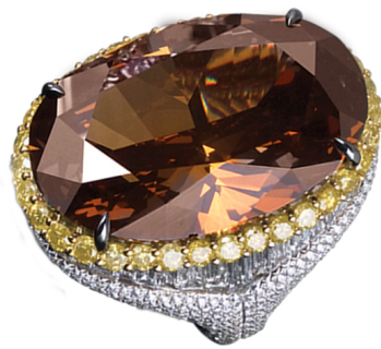
MOUSSAIEFF ORANGY BROWN DIAMOND HIGH JEWELLERY RING